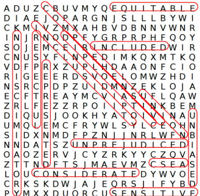
INCLUSIVITY - Answer Key (March 2024 Issue)