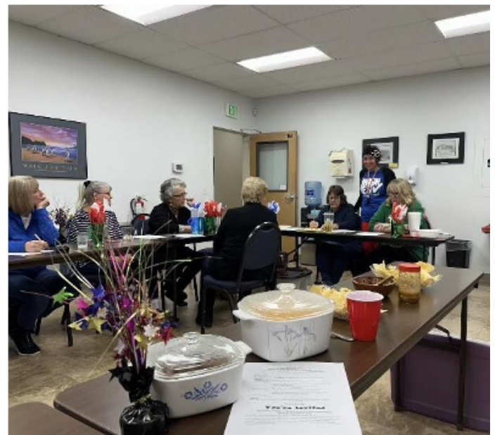
Left and Right photos: Members of Glenn County Chapter #718 share a meal to celebrate Christmas